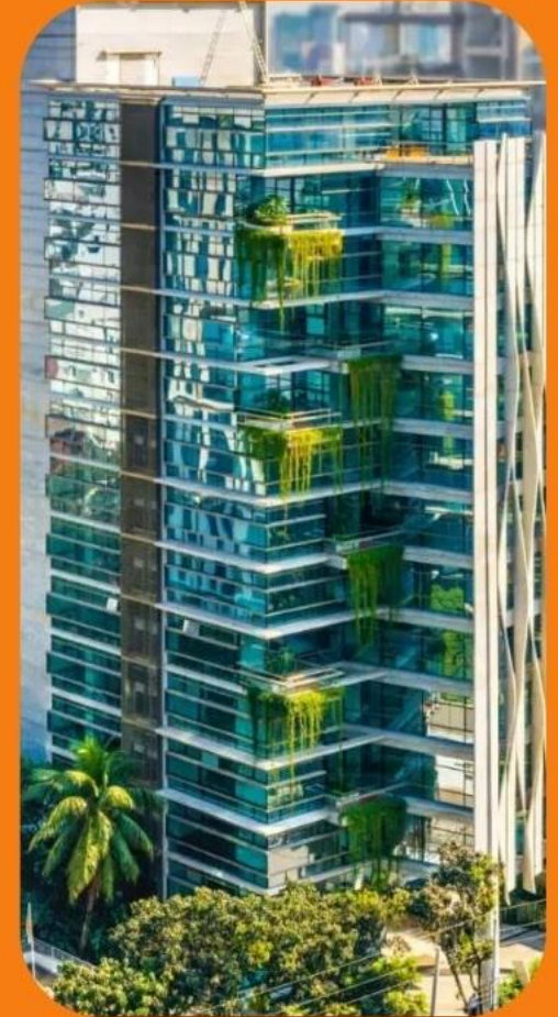
South Breeze, Gulshan 1