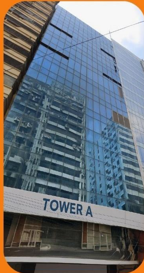
Tower A, Banani