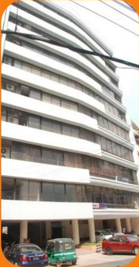
Bilquis Tower, Gushan 2