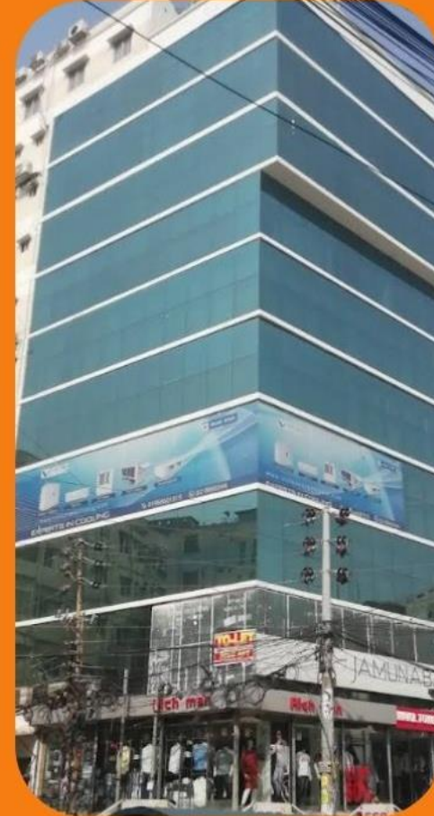
Wakil Tower, Gulshan 1